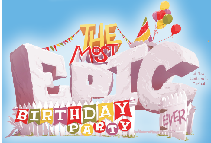
A New Children's Musical